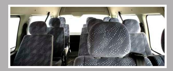
Reclining high quality seats with individual seat belts