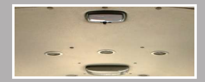
Independent air outlet for each row