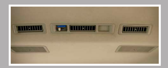
Rear A/C and integrated air outlet